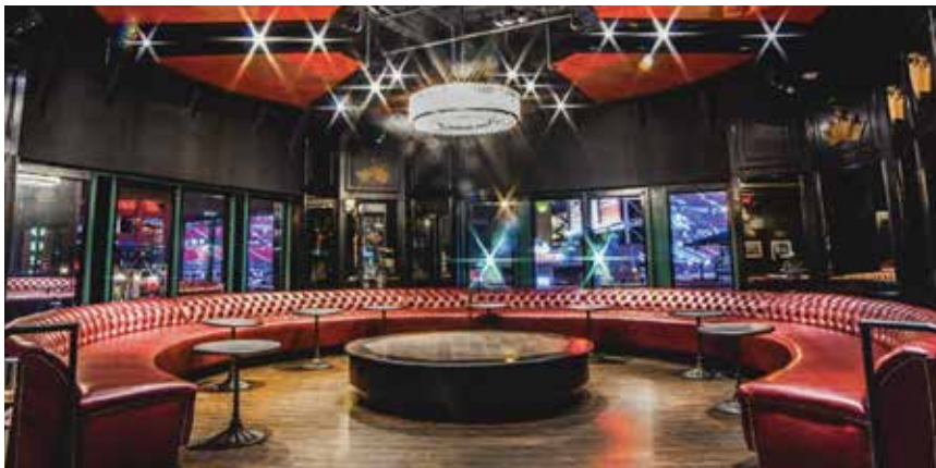
The Crown Room at Ballpark Village, located next door to Busch Stadium.

Stick around after to watch the Cardinals take on the Toronto Blue Jays at 6:45 pm.